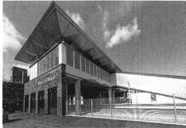
Meridian Water station, completed (2019)

5.15 The Council's CIL Charging Schedule came into effect on 1 April 2016 and to date has contributed over £5m towards the new Meridian Water Station. Due to area-based regeneration and increasing house prices in the borough over the past six years the Council intends to review its CIL Charging Schedule in parallel to carefully align with the new Local Plan, which also has a requirement for consultation and independent examination of the CIL.